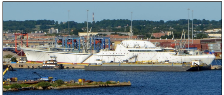
The N.S. Savannah at a port of call

In honor of National Maritime Day 2018, on Saturday, 19 May, companions from the National Capital Commandery toured the N.S. Savannah , the world’s first nuclear-powered merchant ship, now berthed in Baltimore Harbor, Md. Named for the S.S. Savannah , the first vessel to use steam in an ocean voyage from Savannah, Ga. to Liverpool, England in 1819, the N.S. Savannah was designed to demonstrate to the world America’s peaceful use of the atom. “The N.S. Savannah will be dedicated by the people of the United States to peaceful trade and commerce.”, said Dwight D. Eisenhower. With these words, as set out in the National Maritime Day Proclamation of 22 May 1958, the objectives of the Savannah program were made clear for peoples everywhere.