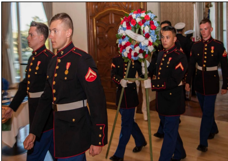
Marine Detail from the Defense Language Institute Monterey presents the Official 2018 Battle of Midway wreath.

A memorial wreath was presented during the formal dinner in recognition of the valor and sacrifice of the heroes that fought at the Battle of Midway and in the Aleutians. "They came from all walks of life – from small towns and big cities – and answered our Nation's call to go to a place they had never seen before. We were losing the war in the Pacific until these heroes fought. Many of them gave the last full measure to help turn the tide of the war so that we could be free as Americans".