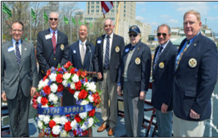
Companions lay a wreath on the deck of the Olympia , with the skyline of Philadelphia in the background.

Representatives from the commanderies presented a wreath honoring the Battle of Manila Bay, Admiral Dewey, and his men. Afterwards, all were invited to tour the ship and to be present at the firing of one of Olympia's secondary guns by a gun crew dressed in period US Navy summer uniforms.