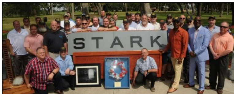
USS Stark Survivors pose for a remembrance photo on the 31st Anniversary of the attack in the Persian Gulf.

The Florida First Coast Commandery teamed up with Naval Station Mayport and the NS Mayport 2nd Class Association to remember the sacrifice of 37 sailors on USS Stark (FFG-31) on 17 May 1987. That day in the central Persian Gulf, USS Stark was struck by two Iraqi Exocet missiles launched from an Iraqi F-1 Jet. The missiles struck the forward part of the ship causing extensive damage. The efforts of the Stark crew and other US surface ships in the area saved the ship and Stark returned to service a year later. Each year the Stark families have gathered at the Naval Station to remember their loved ones. The First Coast Naval Order has co-sponsored the memorial service since the ship was de-commissioned in 1999. The Stark's stern-plate, presented to the Naval Station Stark Memorial Museum last year, was on display at the ceremony.