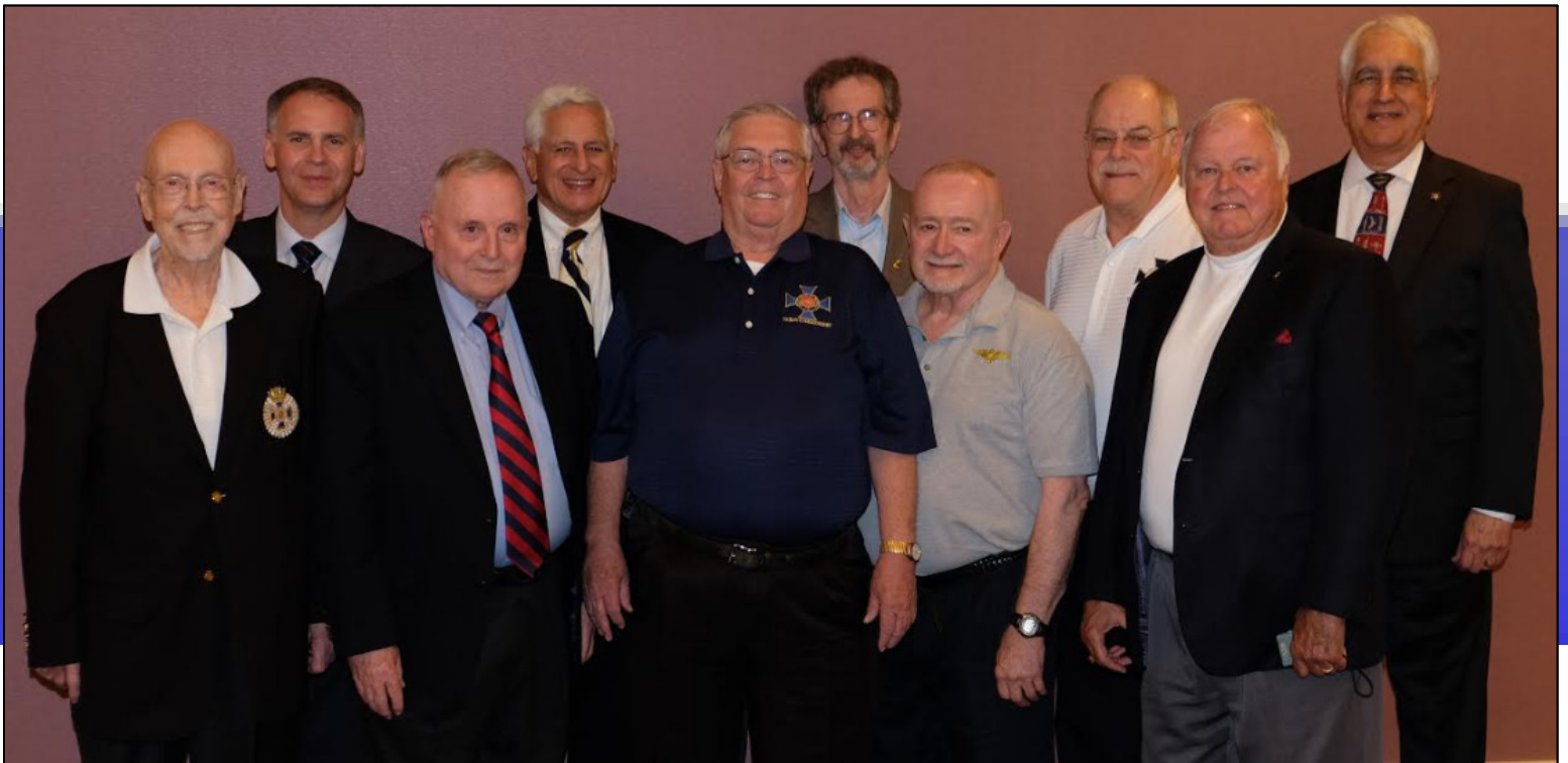
NOUS group picture