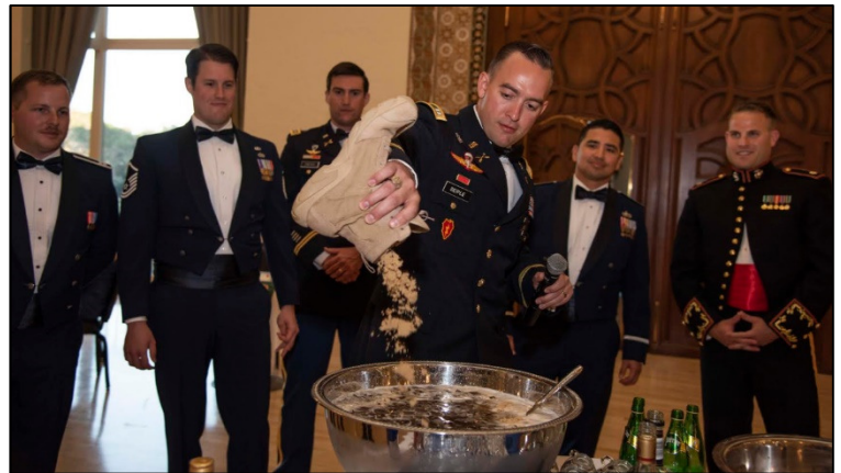
The "grog" bowl is "officially charged" with sands from the "war zone" brought home from recent deployments!