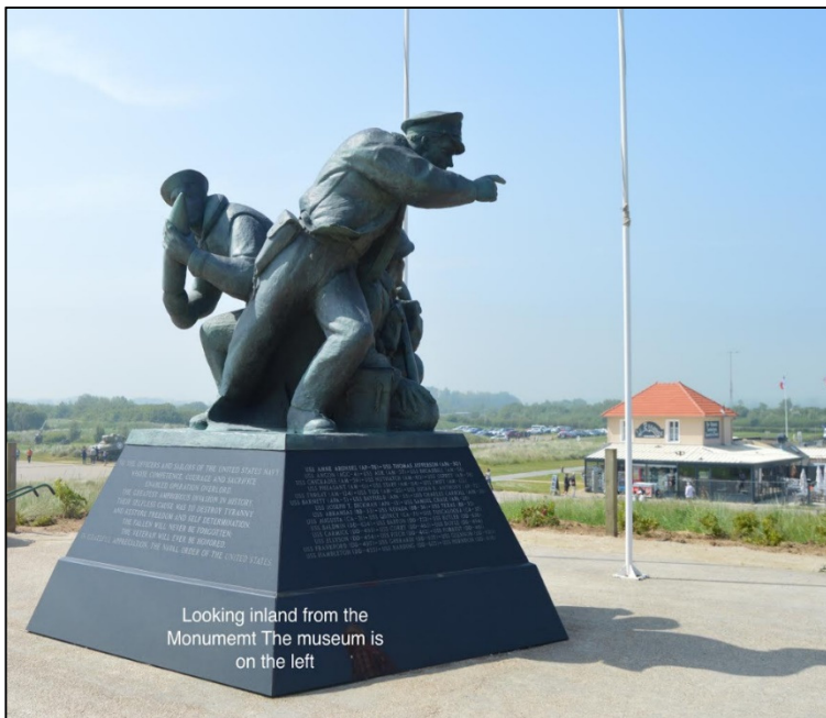
Looking inland from the Monument The museum is on the left