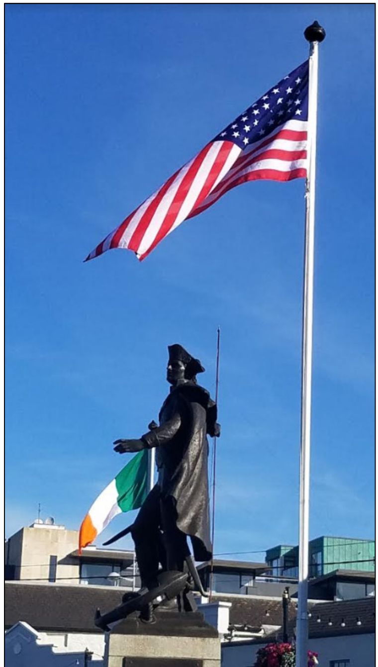
Statue of Commodore John Barry