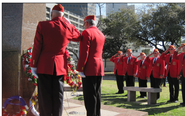
Marine Corps League, McLemore Detachment renders honors at the annual remembrance of the sinking of USS Houston (CA 30), held March 6th at the USS Houston Monument in Sam Houston Park.