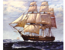
USS Constitution NOUS Honorary Flagship